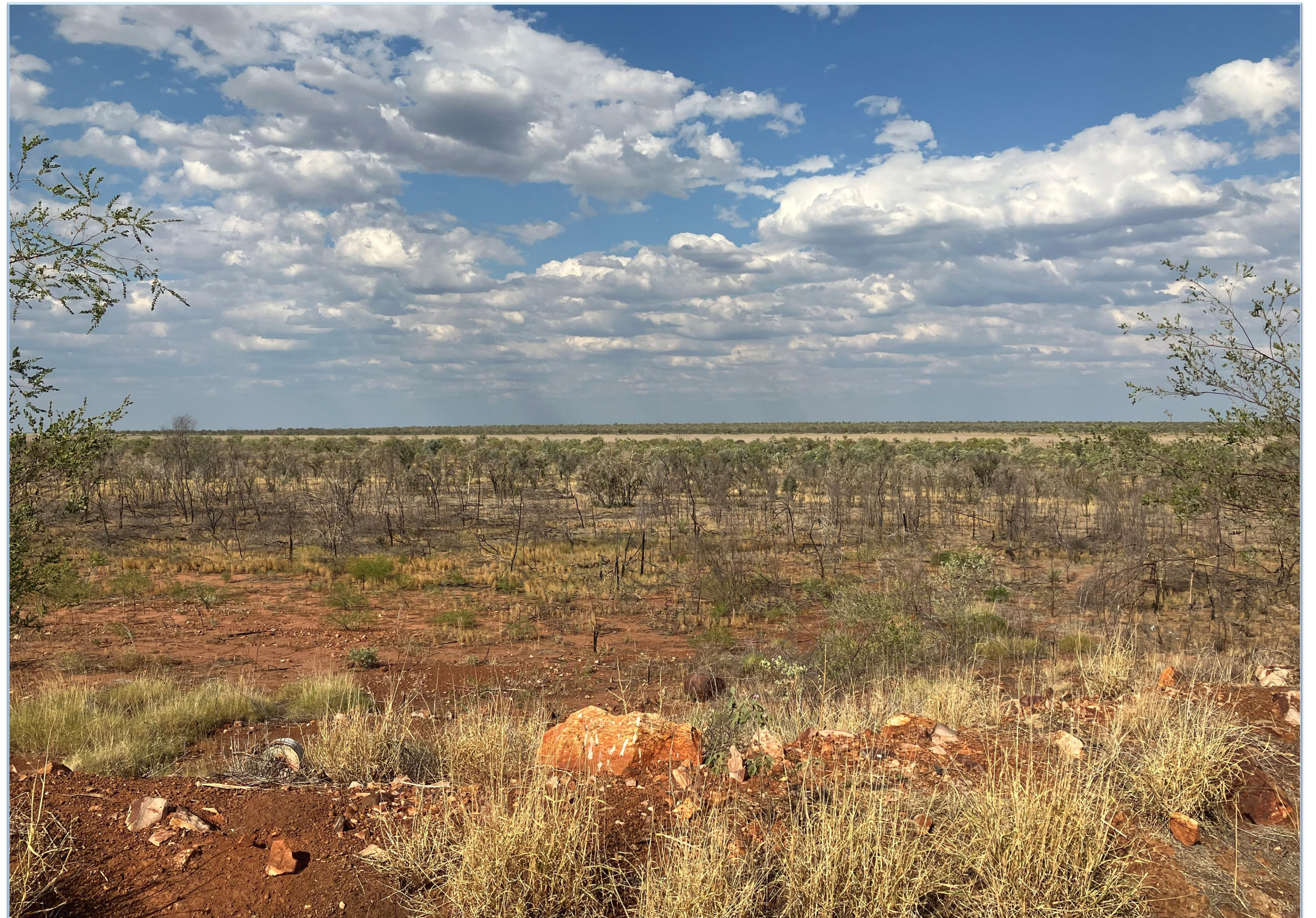
Figure 2: The ephemeral Lake Woods near Elliott is a place of cultural significance to local Aboriginal people. A few months after this photo was taken (2022), the Lake partially filled, bringing a rich diversity of bird, terrestrial and aquatic wildlife.