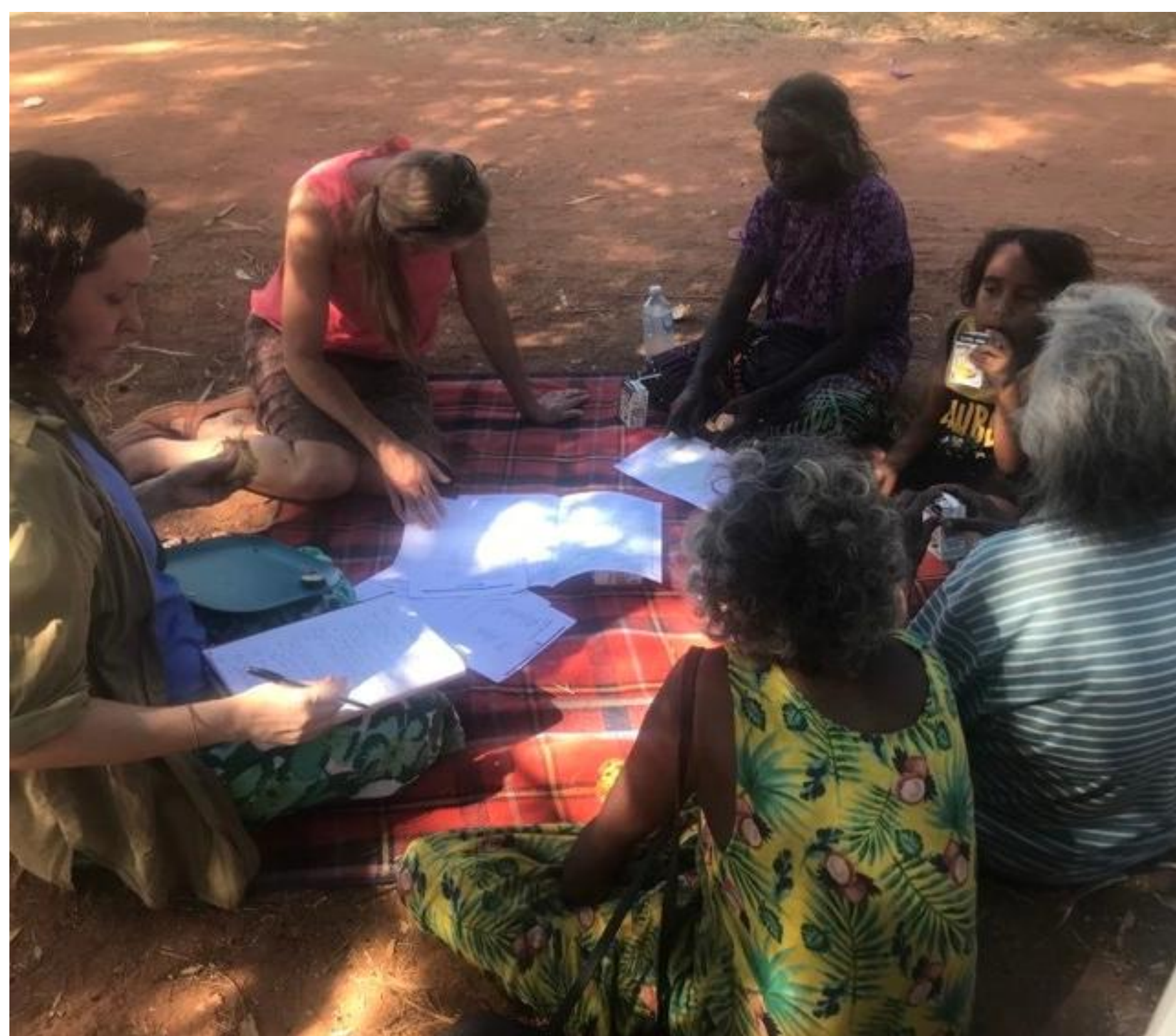
Figure 1: Participatory methods for SCE data collection in the Beetaloo region (2022)